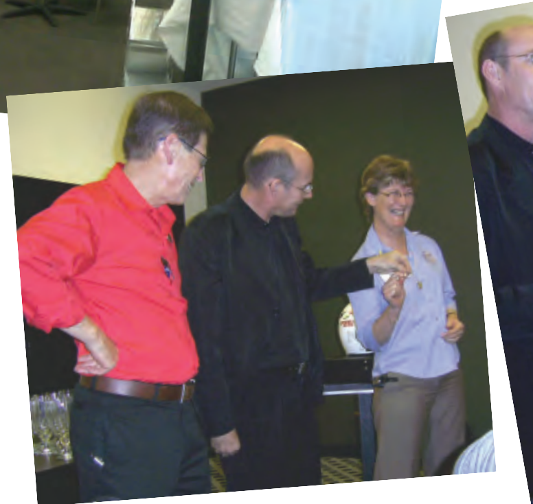
GP Registrars seeking information at the RMFN booth.